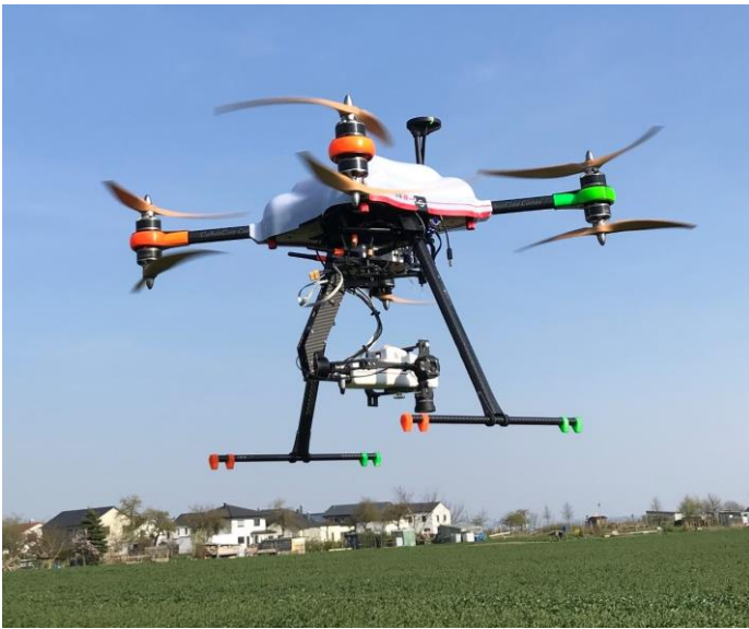
FirefLEYE 185 onboard RTK-X8